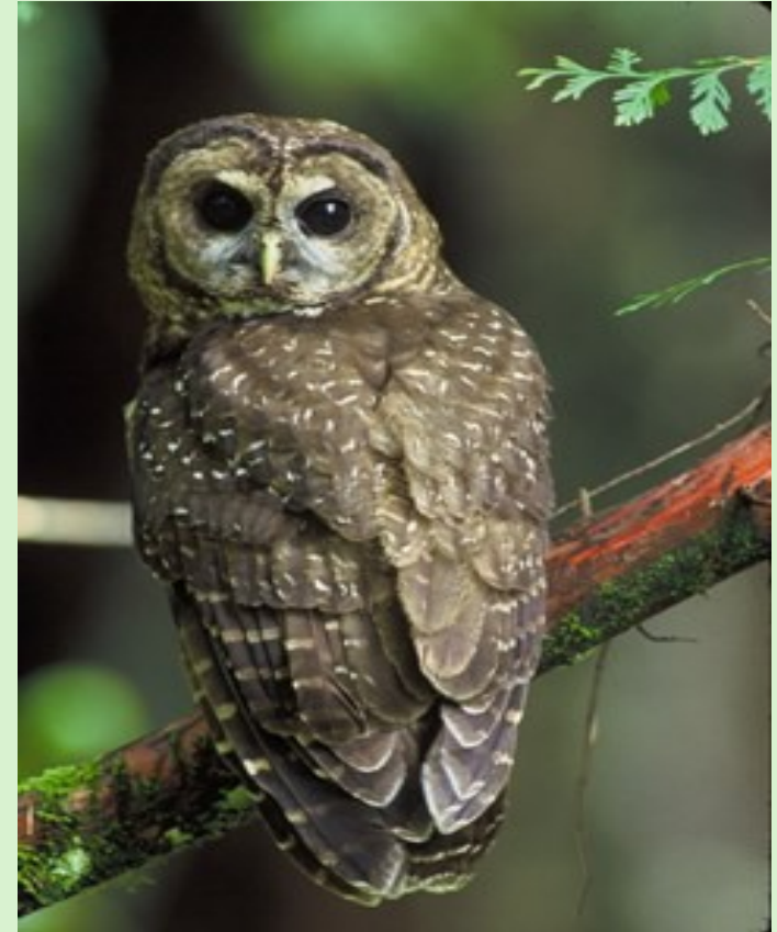
▲ Spotted Owl