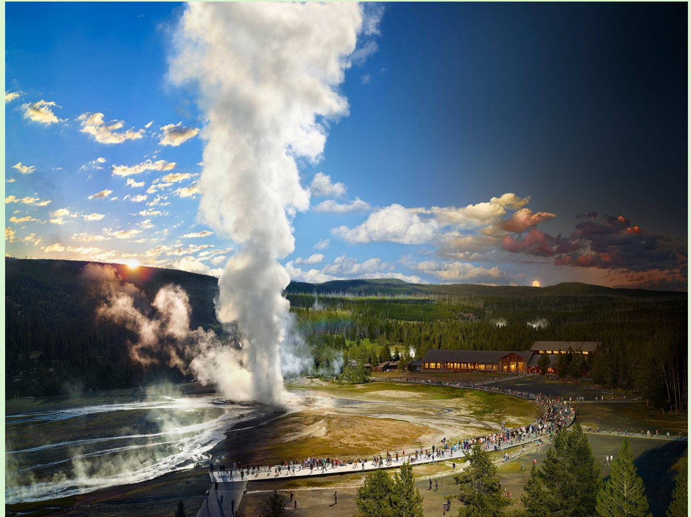
▲ Old Faithful